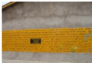
Name of the donors