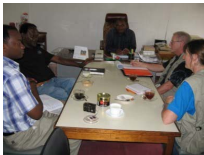
Meeting with Strategic Grain Reserve

The Dodoma office provides programme support to the following WFP Country Programme activities in central Tanzania.