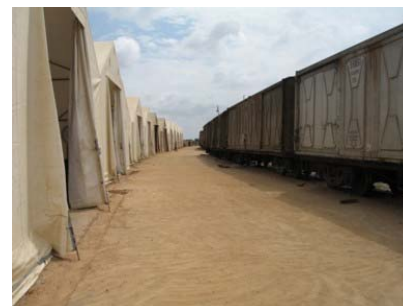
Train to be loaded with cereals