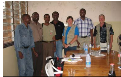
Meeting at MIGESADO

After lunch we also had a meeting with MIGESADO who is the agency which investigate which regions needing help and what kind. So far they have delivered more than 3000 stoves, 250 water tanks have been built with a size of 12-19 cbm. They have constructed a new stove which is based on bio gas, on the unit is also a lamp driven by gas so the user at the same time have light when doing the cooking. The unit can be used in schools or at home by families.