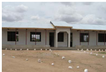
Donated School building

At one side of the building they have painted "Once upon a time.." and then written all the names of the donors. At the time we were there, a journalist / photographer interviewed us and took some photos. The article will be published in a local Swahili newspaper of Dodoma tomorrow.