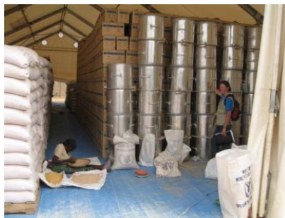
Pots to be delivered to school kitchens