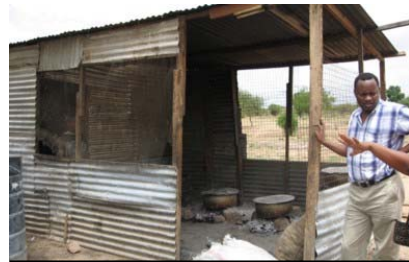
Traditional school kitchen