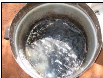
So called cleaned cooking pot

Also at this school we are asking how the food are prepared, if the cereals, maize, beans, etc. has been gone through so nothing less appropriate are in the food. Shortly thereafter, two young students are going through today's meal before preparing the same, if this action has been taken due to our questions, we do not know, but if this is the case, it is good as we have noticed them to be aware of the importance doing so.