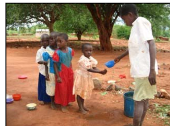
Washing the hands

Shortly after we arrive it is time for breakfast for the students and for the first time we notice that these students are lined up to wash their hands before the breakfast. This we have not seen at the other school so this is a plus for this school.