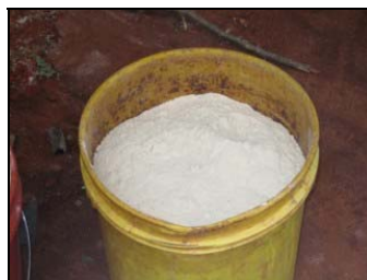
Flour in dirty bucket