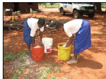
Checking the food

Another thing which is noticed is the cleaning of the cooking pots as well as the containers / buckets used for flour, beans, maize, etc.