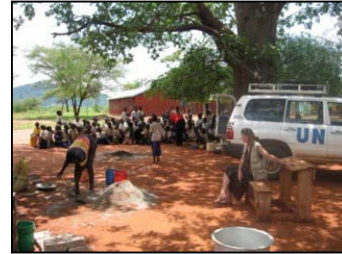
The work starts

It is not much you can see on the ground that it was raining yesterday evening, and when heading to Njiapanda we can see that no rain has fallen outside Mpwapwa town, it is still very dry. We have 81 kilometres on the road before reaching our destination. We greet the Head Master, the Member of the School Committee, the Teachers and the "Fundi". Then the work can start with the construction of the stove.