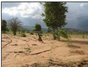
Rain to be expected?

On the way back the skies were cloudy and became darker and darker and a rainfall was to be expected. And yes, it came, and what amount of rain... the closer we came to the village Gulwe, the heavier the rain was falling, thunder and lightning at the same time and the road close to Gulwe changed from a road to be a river.