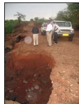
Can we pass without risk?

After we had passed Gulwe we faced another problem, at one place the road was so flooded that it was to risky to cross the stream so we had to stop for an hour, waiting for the stream to be less risky to pass.