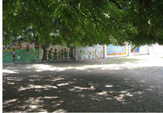
Children's playground at the Salvation Army

Swahili, Swahili, I will soon have nightmares about Swahili. Talking about nightmares, I am at present staying in a hotel having a double bed, what no one told me, was that the other bed was for the cock rogues. Woke up tonight with some of these sweeties in my bed, I had preferred some one else company... And yesterday I had a coke, tasted well until I was to fill up my glass again. Out of the bottle came something which some ones says, well they are rich of protein... I do not really know what it was but it looked like a fly.